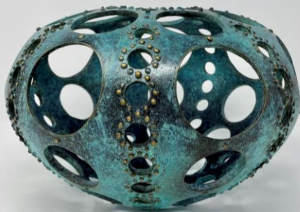
Part of Radial Symmetries Exhibit