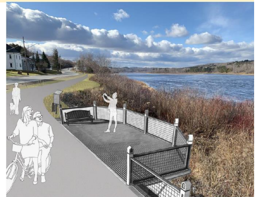
Above is an illustration of a standard lookout.

Before the Old Florenceville Bridge was closed, the plan was to begin engineering a plan for an additional trail on the West side of the river starting at the bridge, going up Jim Davis Drive to Riverview Drive, and out Perkins Way to Sam's Park. This extension would be beneficial for those staying at the Amsterdam Inn to access our Town on foot or by bicycle, while making it more accessible to locals as well.